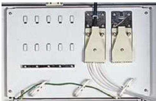
Optical cable inlet unit